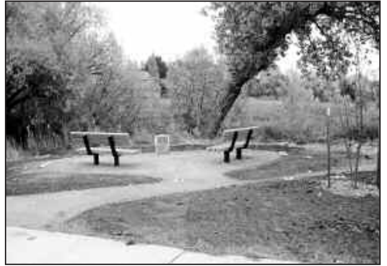
Left Hand Valley Grange Park new benches and re-mounted plaque.