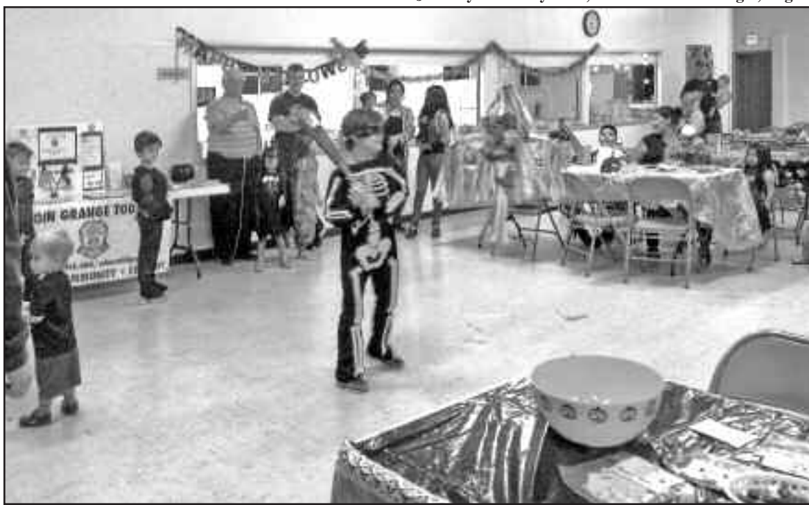
Halloween Party at Wheat Ridge Grange.