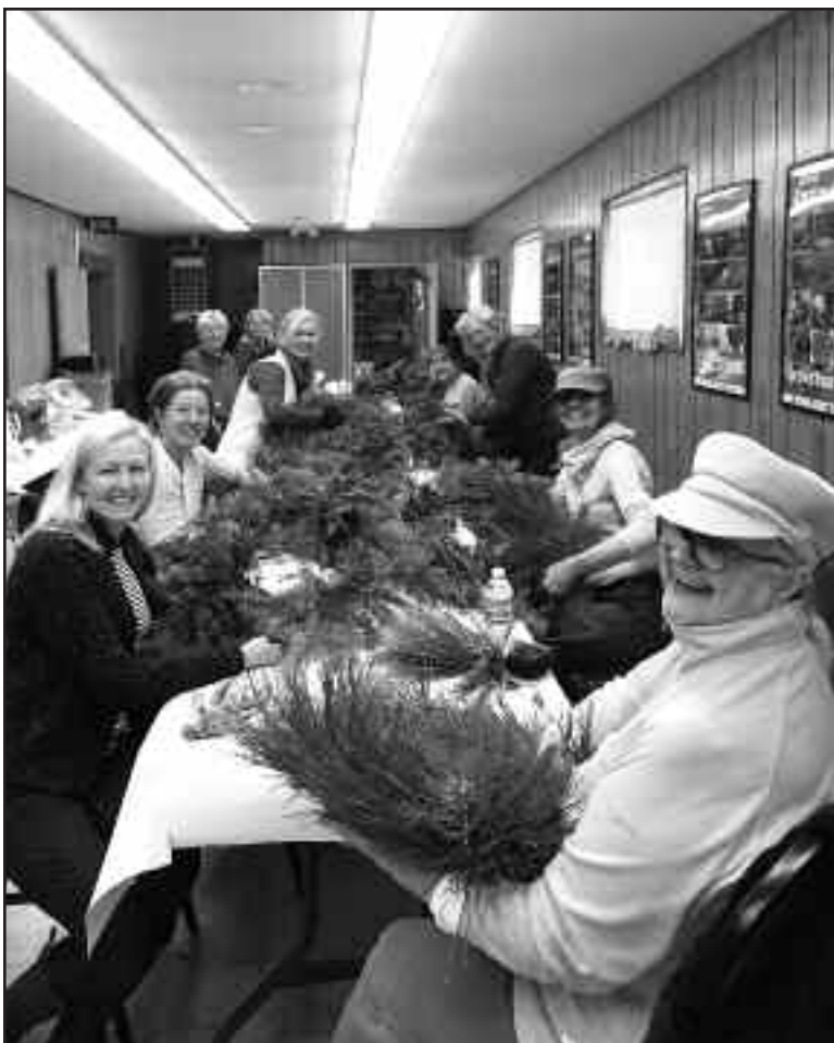
Wreath making at Golden Gate.