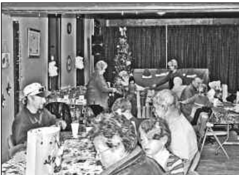
Florissant Grange Christmas Party complete with crafts and goodies.