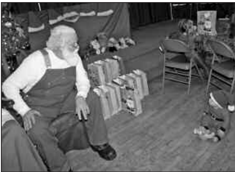
Santa and Baby Santa.