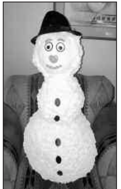
This year's Snowman Piñata was the finale at the Christmas Dinner at Enterprise.

Chipotle Mexican Grill presents a series of films called the Sustainable Food Films every fall. On September 20, we ventured off sight to the Botanical Gardens in downtown Denver for the first of four films. The film that night was Inhabit: A Permaculture Perspective . Inhabit is a feature length