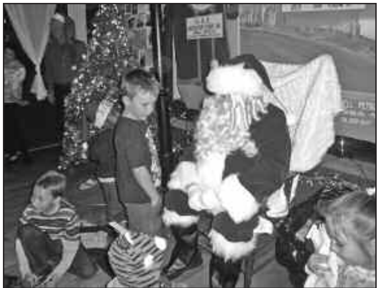
Santa arrived at the Grange and gave the children Teddy Bears or Character Hats.

Saturday, February 11, 2017 — High Tea at the Enterprise Grange Hall starting at 2 p.m.