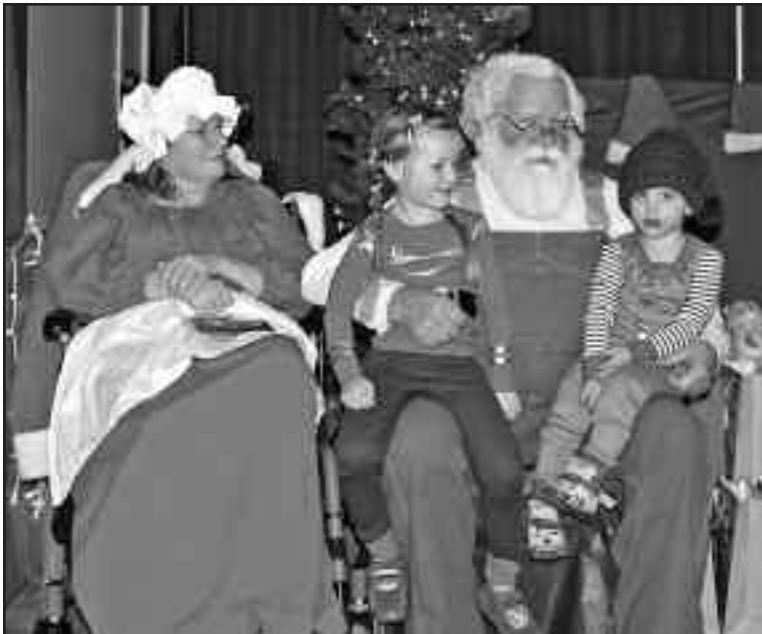
Florissant Grange Mrs. Claus, Santa and kiddos.

See Page 8 for information from Mount Lookout and Left Hand Subordinate Granges.