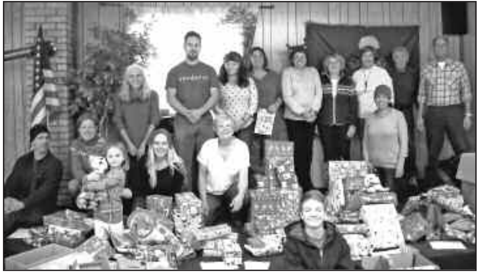
Thanks to all who donated to the Jeffco Foster Kids' Gift Drive! And, thanks to all those who helped wrap hundreds of gifts! You all showed the true meaning of the holidays with your generosity and your time! Merry Christmas and Happy Hanukkah!