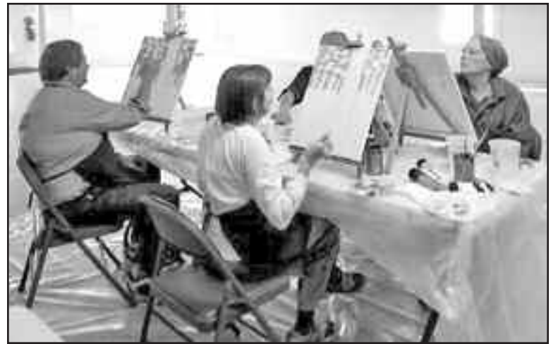
Painting Class at the Left Hand Grange.