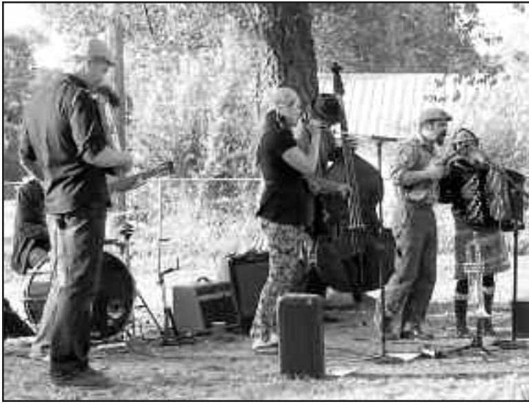
Live music at Mount Lookout Grange Pig Roast.