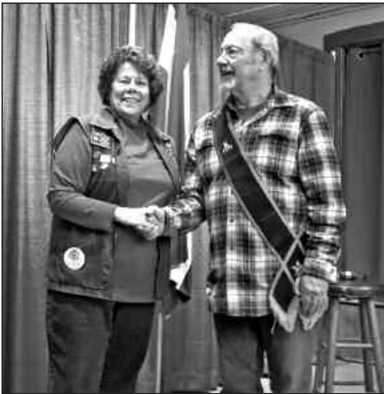
VFW Ladies Auxiliary presents grant check to Florissant Grange.