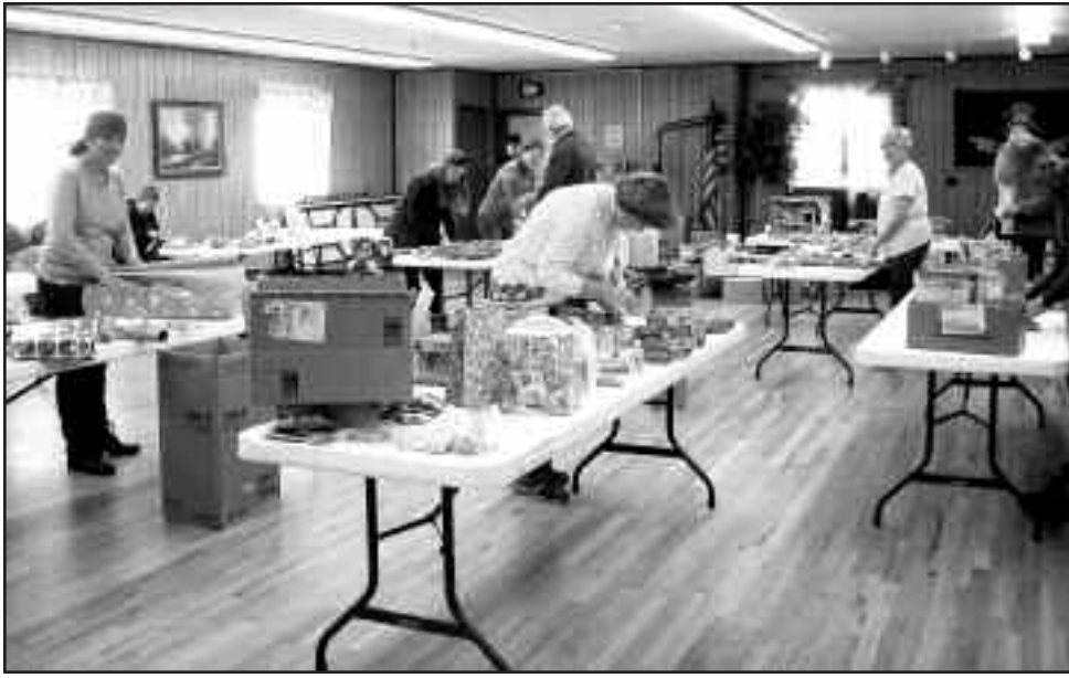
Jeffco Foster Kids' Toy Drive and Wrapping Party at the Golden Gate Grange.