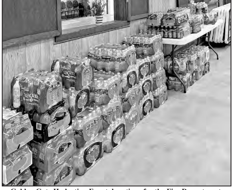
Golden Gate Hydration Event donations for the Fire Department.

Our annual RUMMAGE SALE will be held on Friday, August 1 and Saturday, August 2, this year. Start cleaning out those closets! We would appreciate donation of your gently used items. Please be sure clothes are clean and not damaged. No tires, mattresses, televisions, computer equipment, sofas, pressed board, or other large items of furniture. If you have any questions about