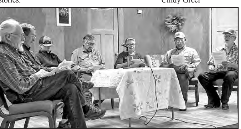
"Grange Beginnings" skit during the Grange 150th celebration.