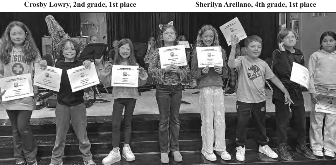
Plant Sale Poster contestants and winners from Sedalia Elementary School.