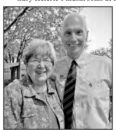
Participants at the Agriculture Social held at Sunflower Grange.

market. (https://www.instagram. com/sandyswaymicrofarm/?hl=en) Cale brought squash and cucumber plants to the May sale.