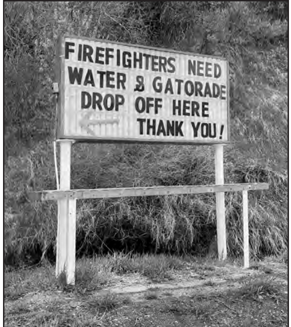
Hydration Event sign at Golden Gate Grange.