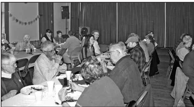
Over 100 people attended Florissant's Valentine's Day Brunch.