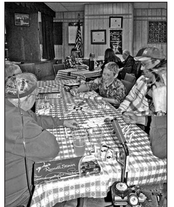
Hot game of Dominoes at Marvel Grange's New Year's Eve Party.