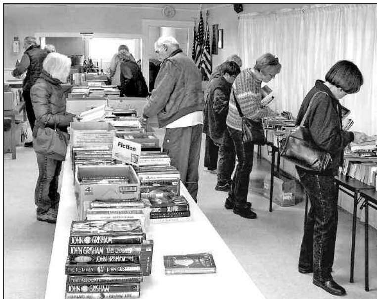
Shoppers at the Left Hand Grange #9 Used Book Sale on February 5.