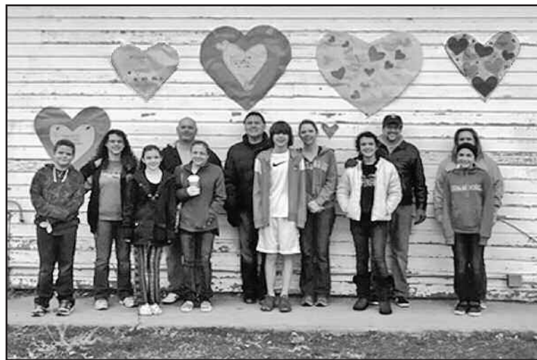
Crescent Grange heart bombing participants.