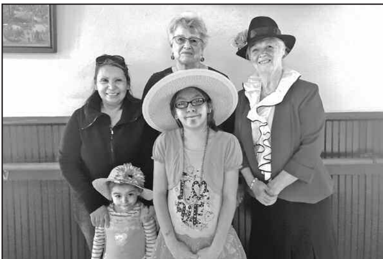
Attendees from Shannon's Hope who benefited from the fundraiser.