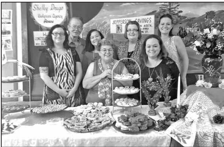
Grange staff who helped at the Tea.

April 16 — Spring Craft Show and Sale at the Florissant Grange from 9 a.m. to 3 p.m. This is a great place to find one of a kind gifts for (Continued on Page 6)