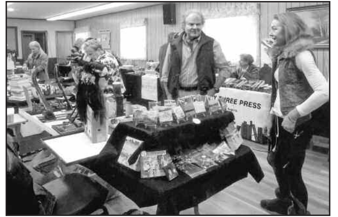
Craft Fair at Golden Gate Grange on November 14, 2015, featured a wide variety of arts and crafts, baked goods, and lunch was available.