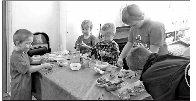
Marvel Junior Grangers decorating cookies for the Senior Citizens Lunch.