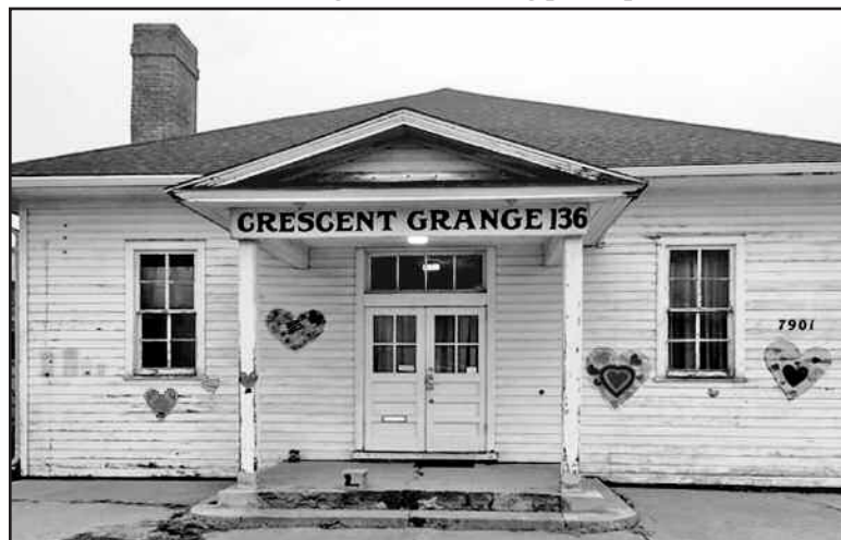
Crescent Grange Hall decorated with hearts.