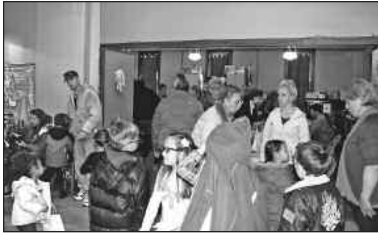
The Grange Hall crowded with kiddos.