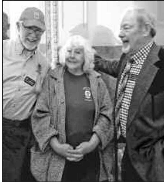
Colorado Grangers visited the State Capitol to celebrate Agriculture Day on March 22, 2017.