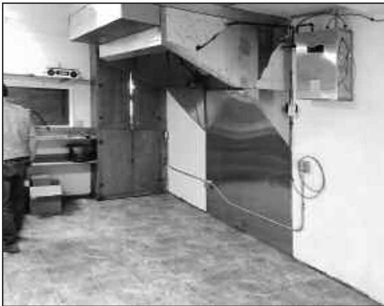
Mount Lookout Grange expansion project is nearing completion.