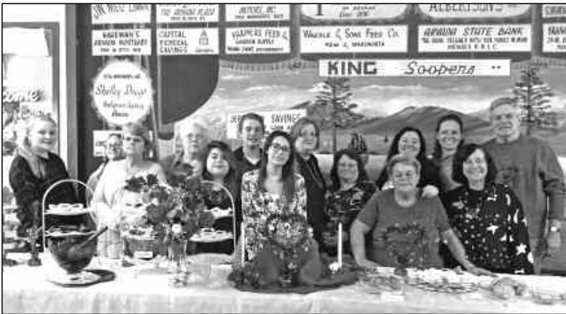
Enterprise Grangers and Friends who worked so hard to make the High Tea a huge success.