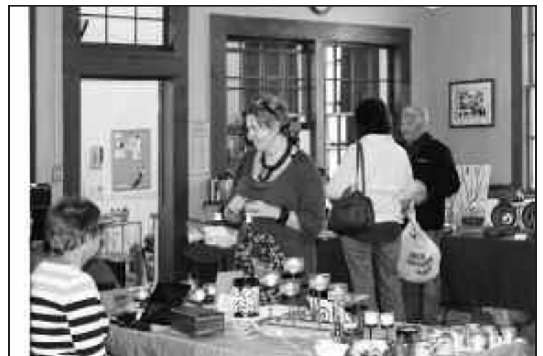
Aspen Ridge Lotion Candles by Regina Sollars.