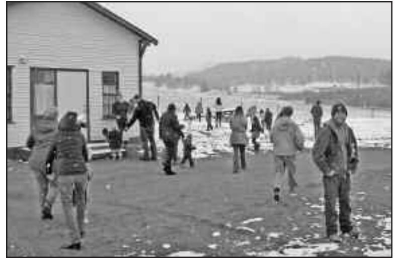
Easter Egg Hunt — snow and all.