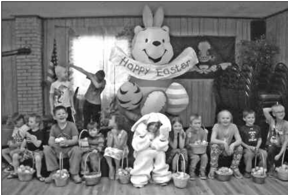
Easter Egg Hunt at the Golden Gate Grange.