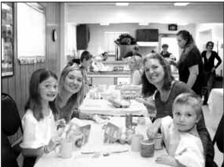
Dyeing Easter Eggs at the Golden Gate Grange.