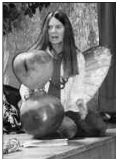
A member of the Sleeping Ukes playing Gourds.

April 21 we celebrated Marvel Grange's 60th anniversary and the 150th year of the National Grange