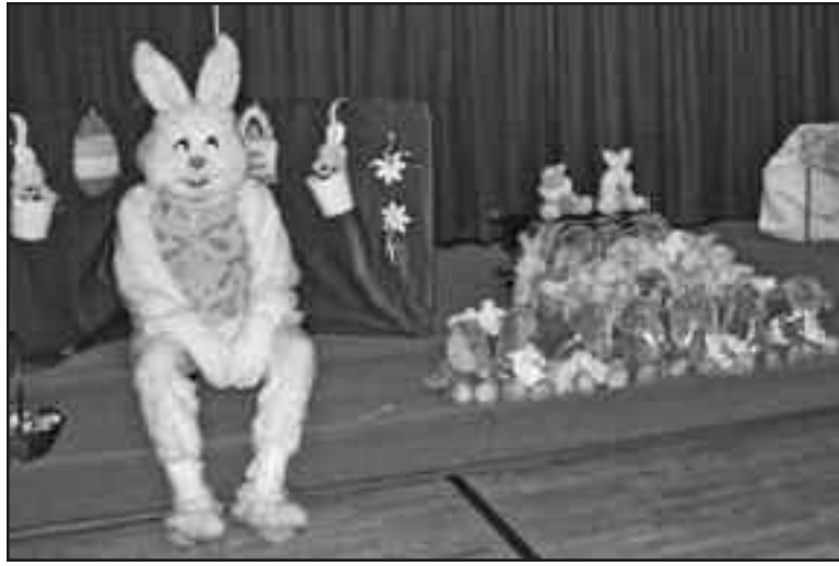
Easter Bunny with his giveaway goodies.

and new who celebrated with her. April 15 we are hosting a Chickens 101 class and April 29 is our Chili