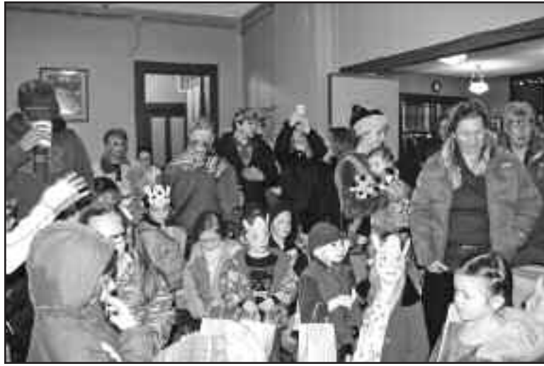
Kiddos lined up for the Easter Egg Hunt.