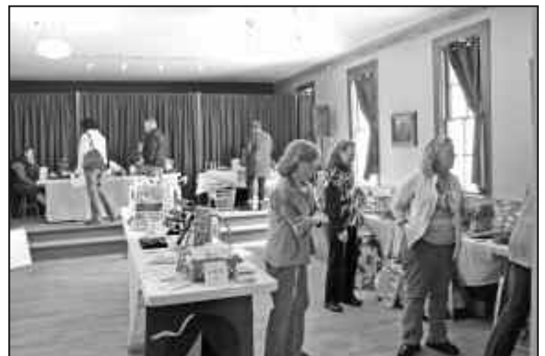
Spring Craft Sale Shoppers and Vendors.