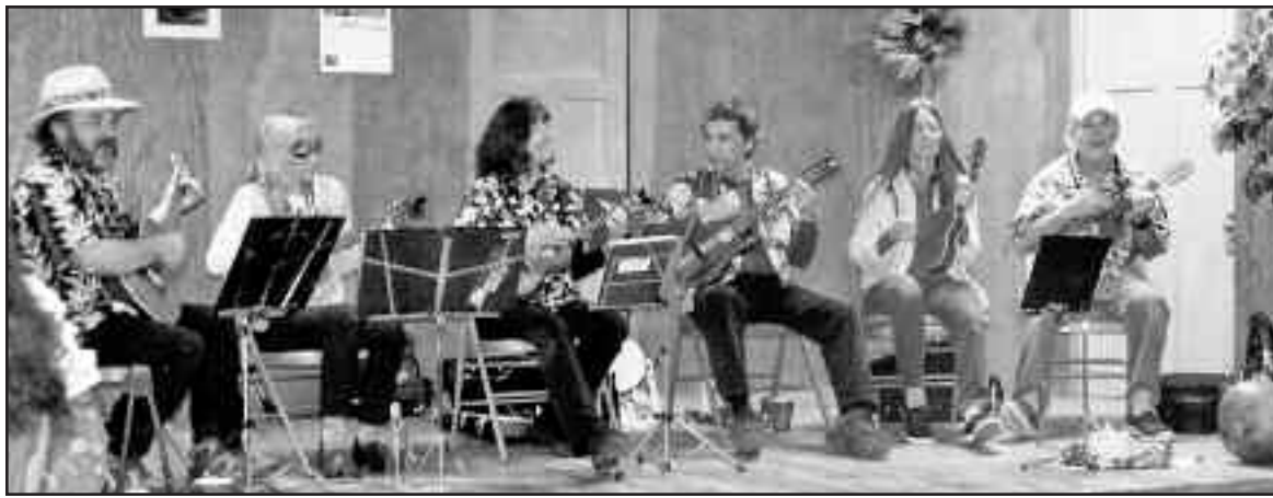
The Sleeping Ukes.

with a potluck supper and honoring an outstanding community citizen and Granger. More on this event later.