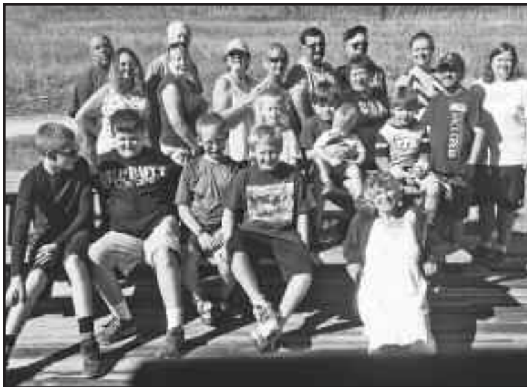
Family Summer Camp 2016