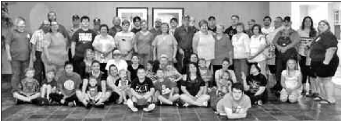
The Great Plains Leadership Conference