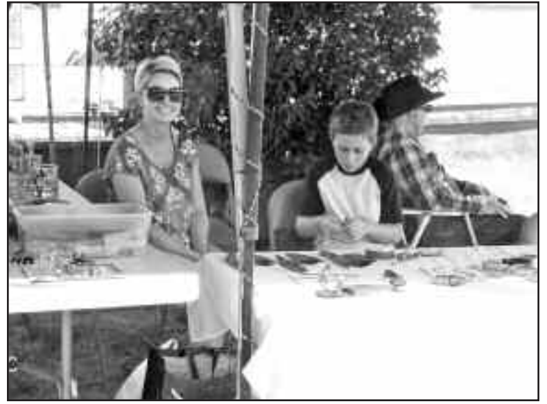
Heritage Day at Florissant Grange