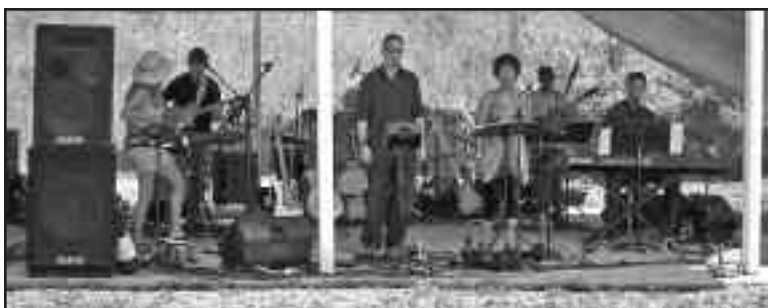
Beatles Tribute Band Captain Quirk and Friends performed in July.