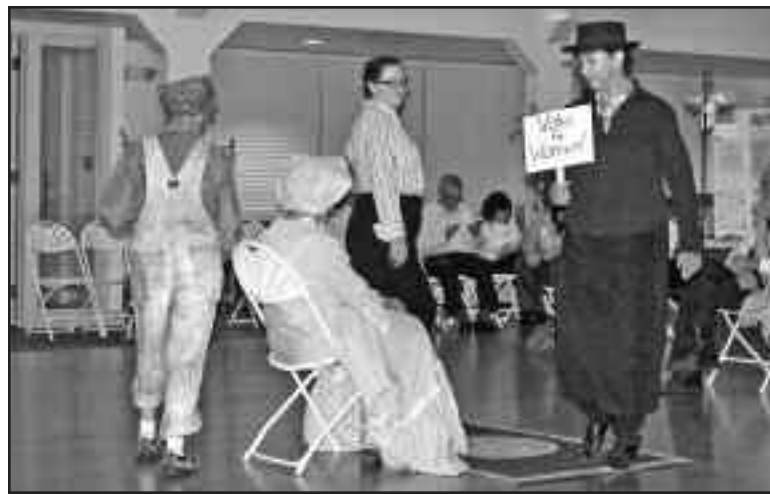
The Rose Drill Team.