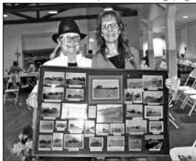
Photos of the past found by Great-Great and Great-Great Granddaughters.