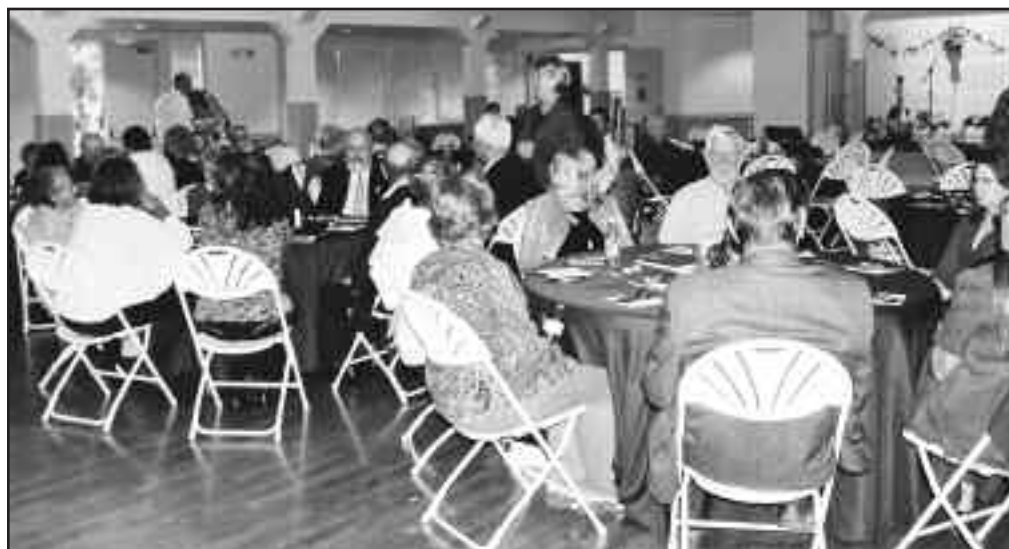
Grangers enjoying the Banquet.