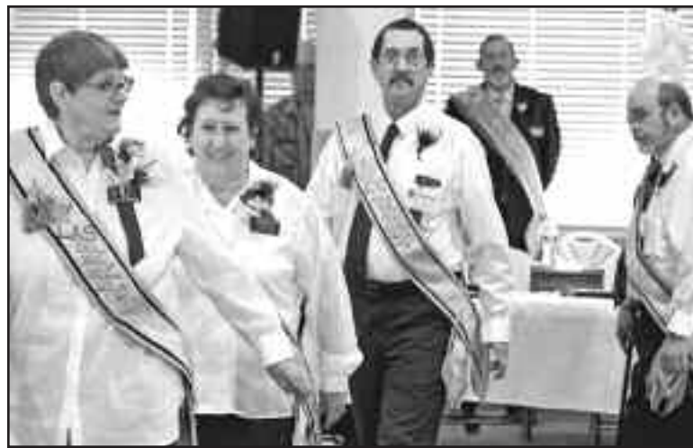
State Officers marching in.

bidding on items and attending to the tables, and Thank you to everyone behind the scenes who did something we don't know about. We can't say thank you enough to each and every one of you for everything.