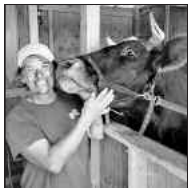
The "What's Up On Redlands Mesa" tour included a stop at Peace & Plenty Farm.

of art and nature that included hiking trails, museum quality art and beautiful views. The evening ended with music and wine tasting at Jack Rabbit Hill, our local vineyard with music provided by The Soul Brothers, one of our talented Grange members and his partner. The event was such a success that we are already planning for next year.