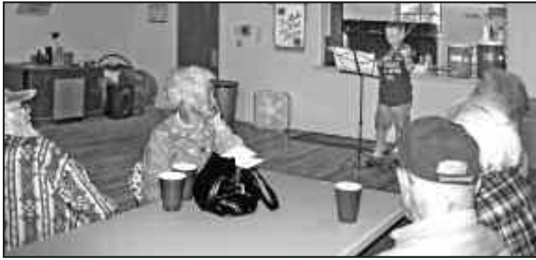
Exhibit Day at Florida Grange.