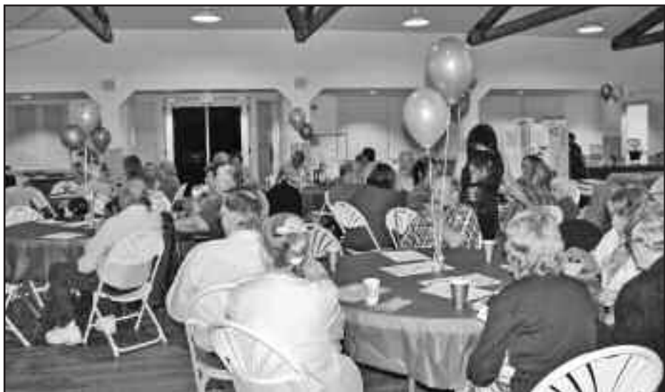
Grangers enjoy the Gala Friday Night.