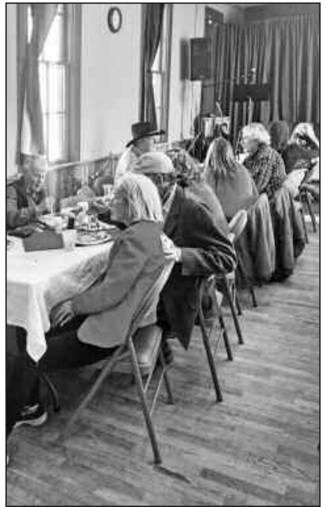
Florissant Grange's pre-Valentine's Brunch on February 11.